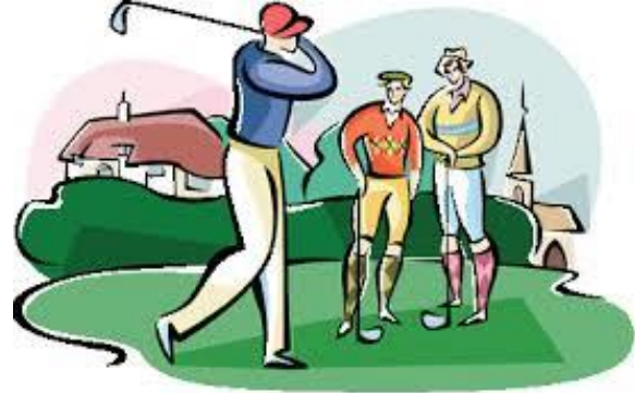
2017 Survey: top reasons for staying in the Men's Club.